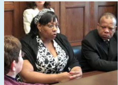
Above, members of St. Camillus visit their Senator to share their concern about war in the DRC. Below, they sell crafts.

Back at the parish, they stepped with the charitable works foot by holding a craft sale to benefit Catholic Relief Services programs that assist victims of war in the DRC.